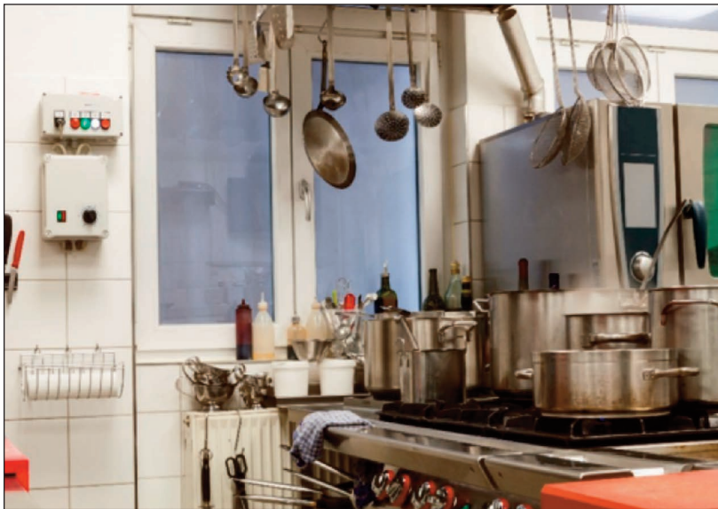
FIGURE 5: Kitchen in a Poorly Designed Area

Unfortunately, commercial kitchens are quite often built in spaces not originally designed for that purpose. There may be an inadequate make-up air supply, hoods may be incorrectly sized, and efficiency controls are generally non-existent (see Figure 5 as example).