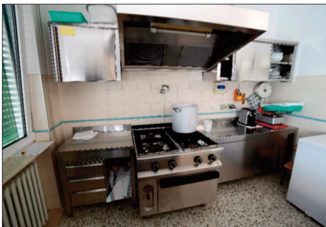
FIGURE 1: Community Kitchen

Cooking equipment tends to have an extremely long life cycle and there is a large market for used equipment, so penetrating this market