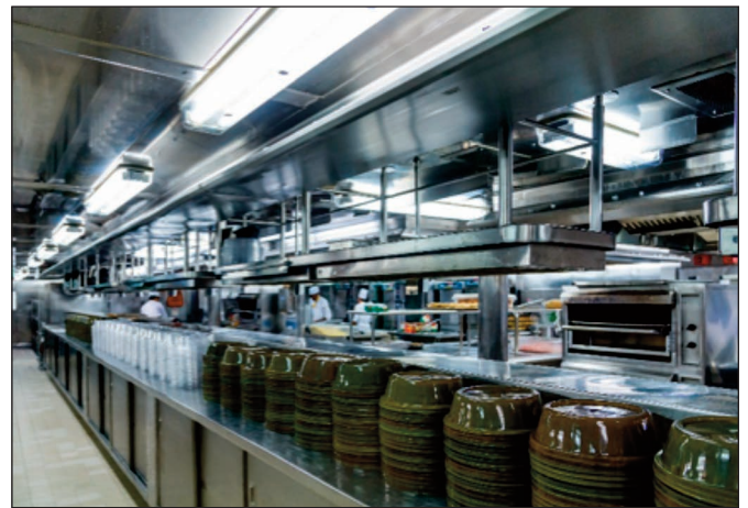
FIGURE 2: Commercial-Scale Kitchen