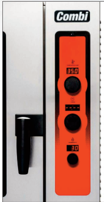
FIGURE 4: Vulcan ABC7E Controls

The genius of combi-ovens is that they can replace about half of traditional commercial cooking appliances.