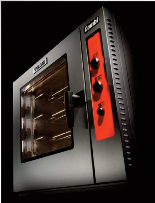
FIGURE 3: The Vulcan ABC7E Combi-oven