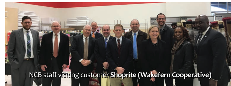
NCB staff visiting customer Shoprite (Wakefern Cooperative)

Cooperatives large and small provide important and valuable services to their members in communities and neighborhoods all across the country.