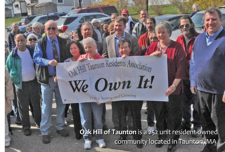
Oak Hill of Taunton is a 252 unit resident owned community located in Taunton, MA